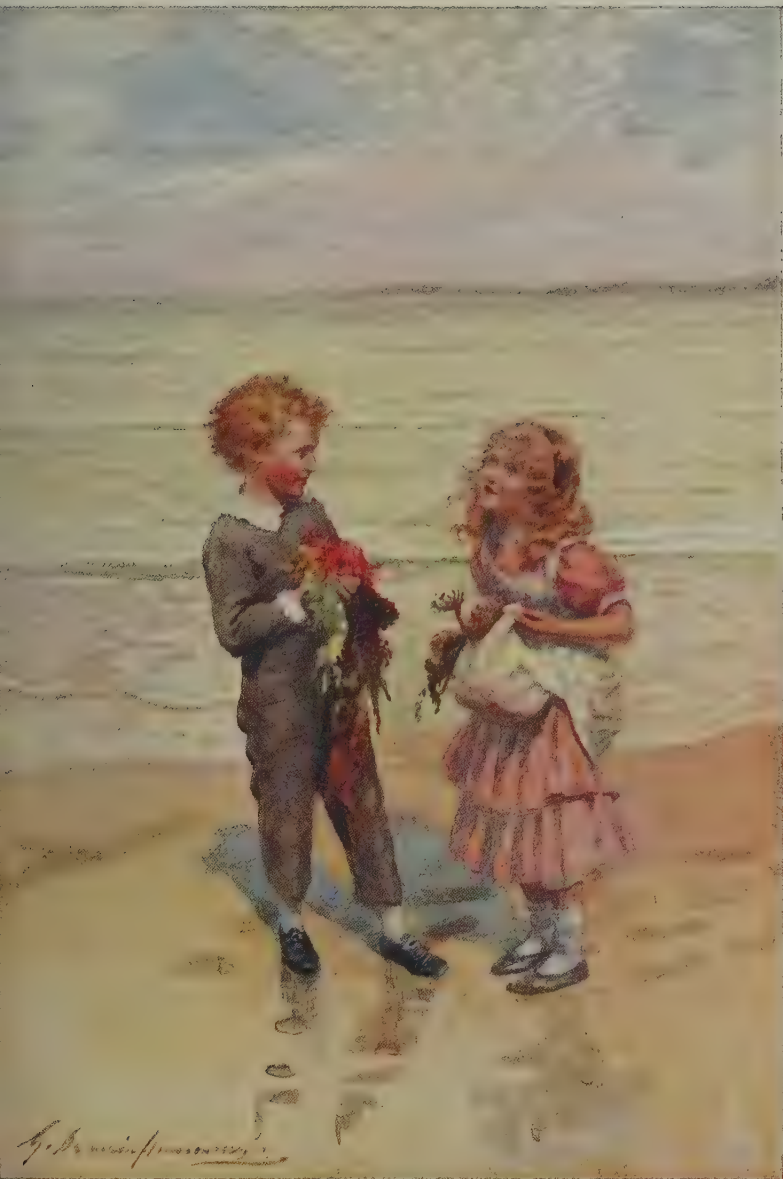
LITTLE EM'LY HAD STOPPED AND LOOKED UP AT THE SKY